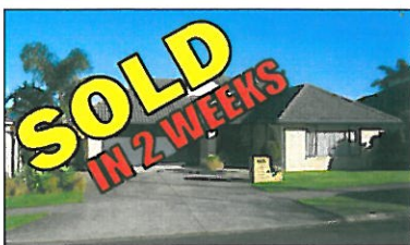
Lansell Drive, Dannemora