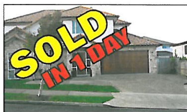
Gibbston Cres, Mission Heights