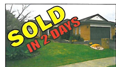
Glanworth Place, Dannemora