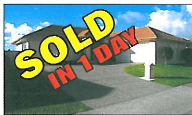
Lansell Drive, Dannemora