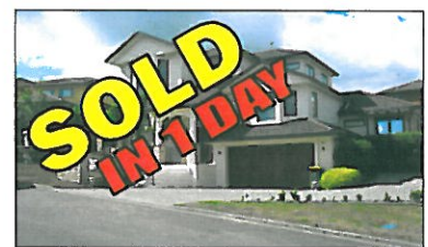
Brookridge Rise, Dannemora