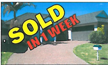
Glencullen Place, Dannemora