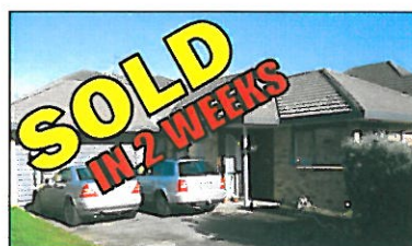
Ben Nevis Place, Northpark