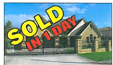
Bejoy Rise, Dannemora